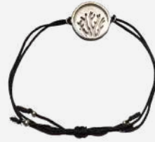
Innoceana coral bracelet